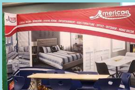
Example of Customized Mobile Display Branding