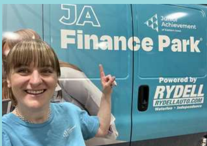
Example of Van Branding