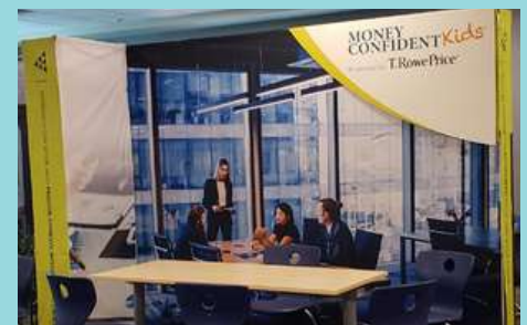
Example of Pre-Designed Display Branding